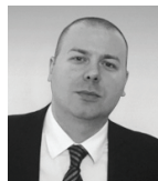
HNW Trading Underwriter – North