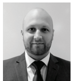
Broker Manager – South