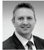
Regional Manager – North