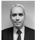
Broker Manager – South West