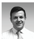
HNW Trading Underwriter – South