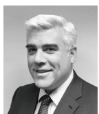
HNW Specialist – South