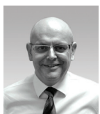
HNW Trading Underwriter – South