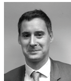
Broker Manager – North East & East