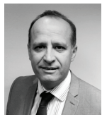
Broker Manager – South East