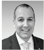
Regional Manager – South