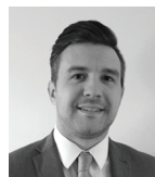
Broker Manager – Northern Ireland