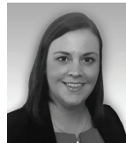
Broker Manager – Scotland, North West & Midlands